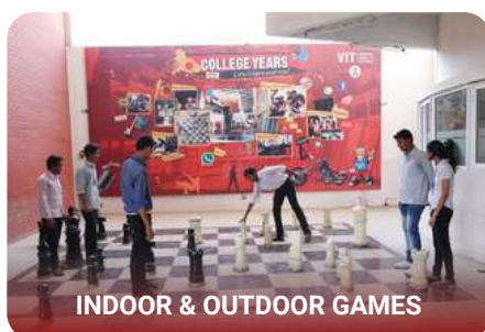
INDOOR & OUTDOOR GAMES