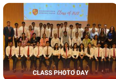
CLASS PHOTO DAY