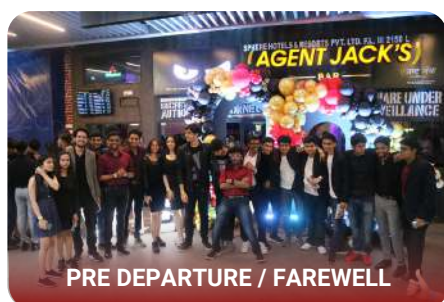
PRE DEPARTURE / FAREWELL