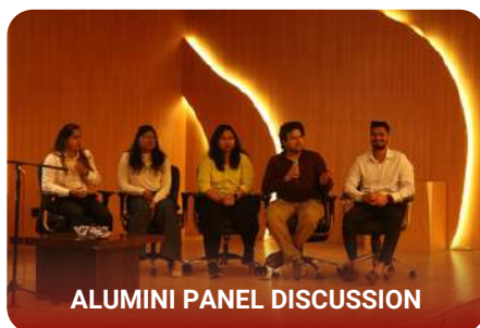
ALUMINI PANEL DISCUSSION