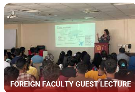
FOREIGN FACULTY GUEST LECTURE