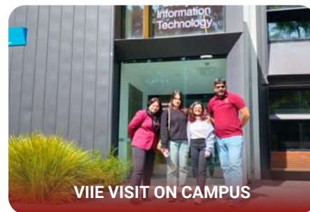
VIIE VISIT ON CAMPUS