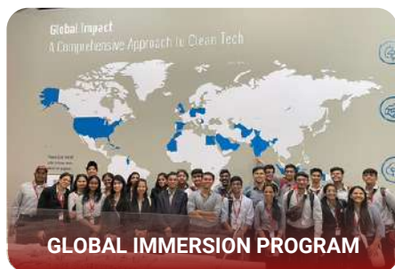
GLOBAL IMMERSION PROGRAM